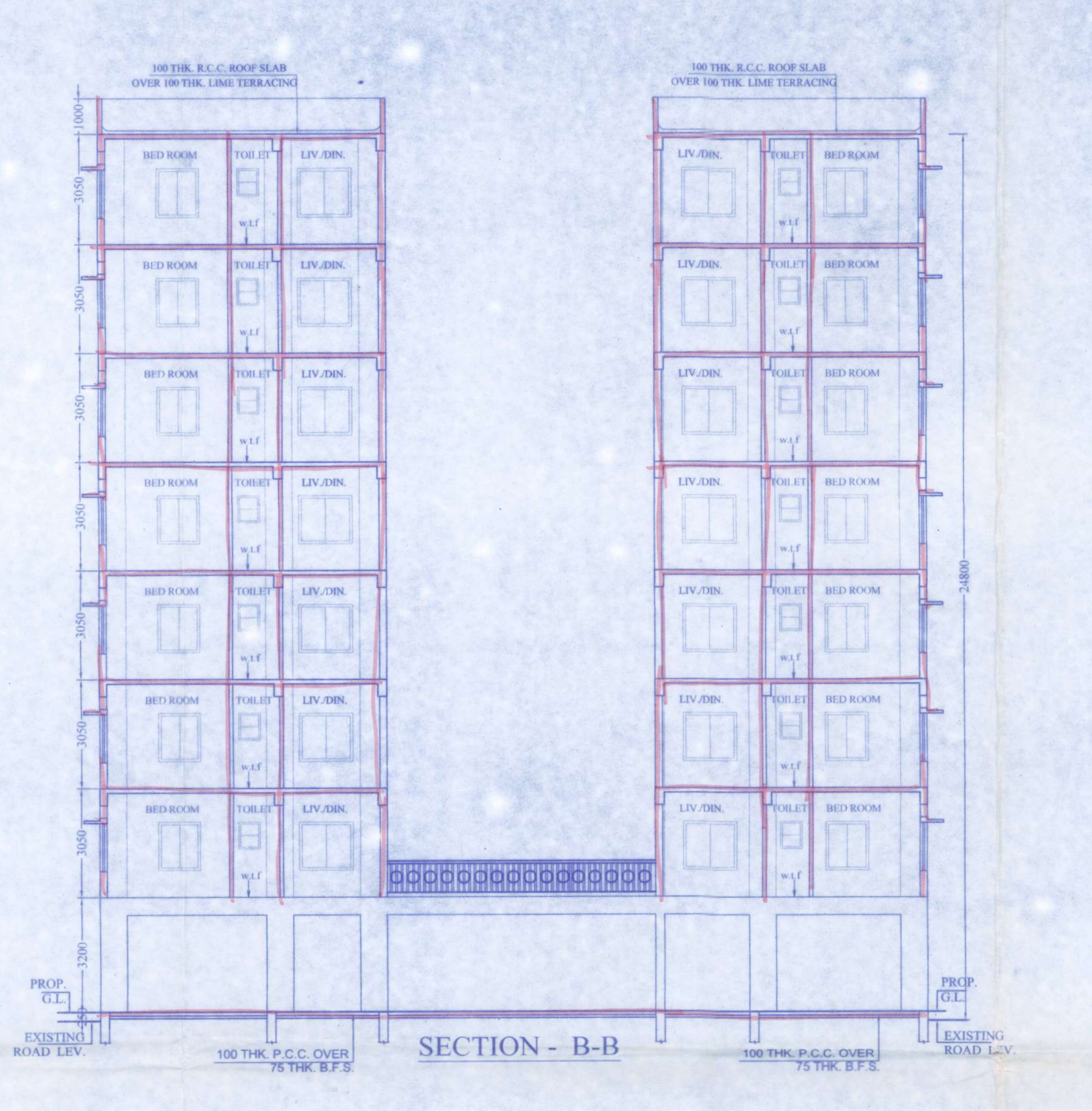
SECTION - B-B